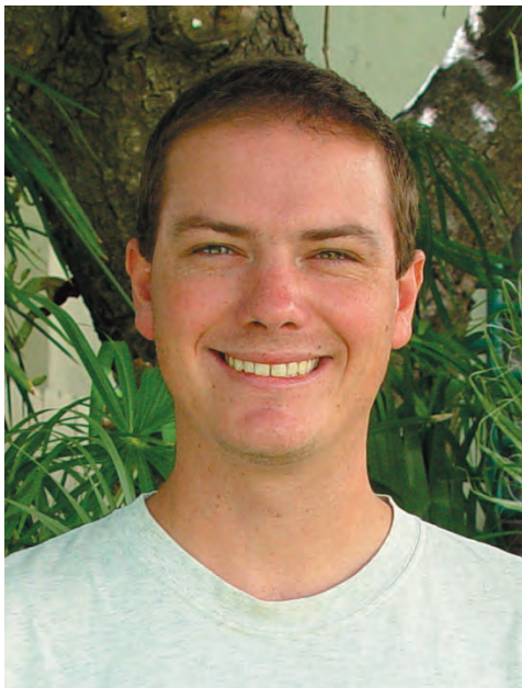
Ben Lowe Squamate Systematics