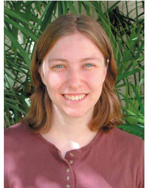
Sara Tin Bacteria