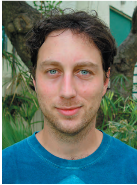
Casey Richart Opilionid Systematics