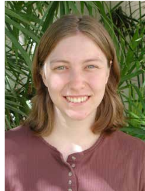
Sara Tin Archaeobacteria